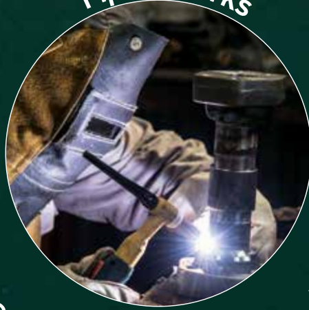
Propeller & Shafts